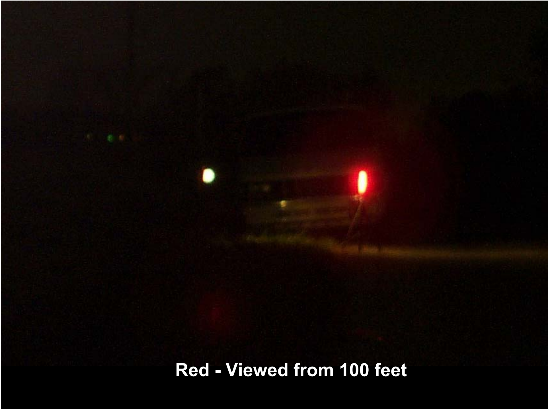
Red - Viewed from 100 feet