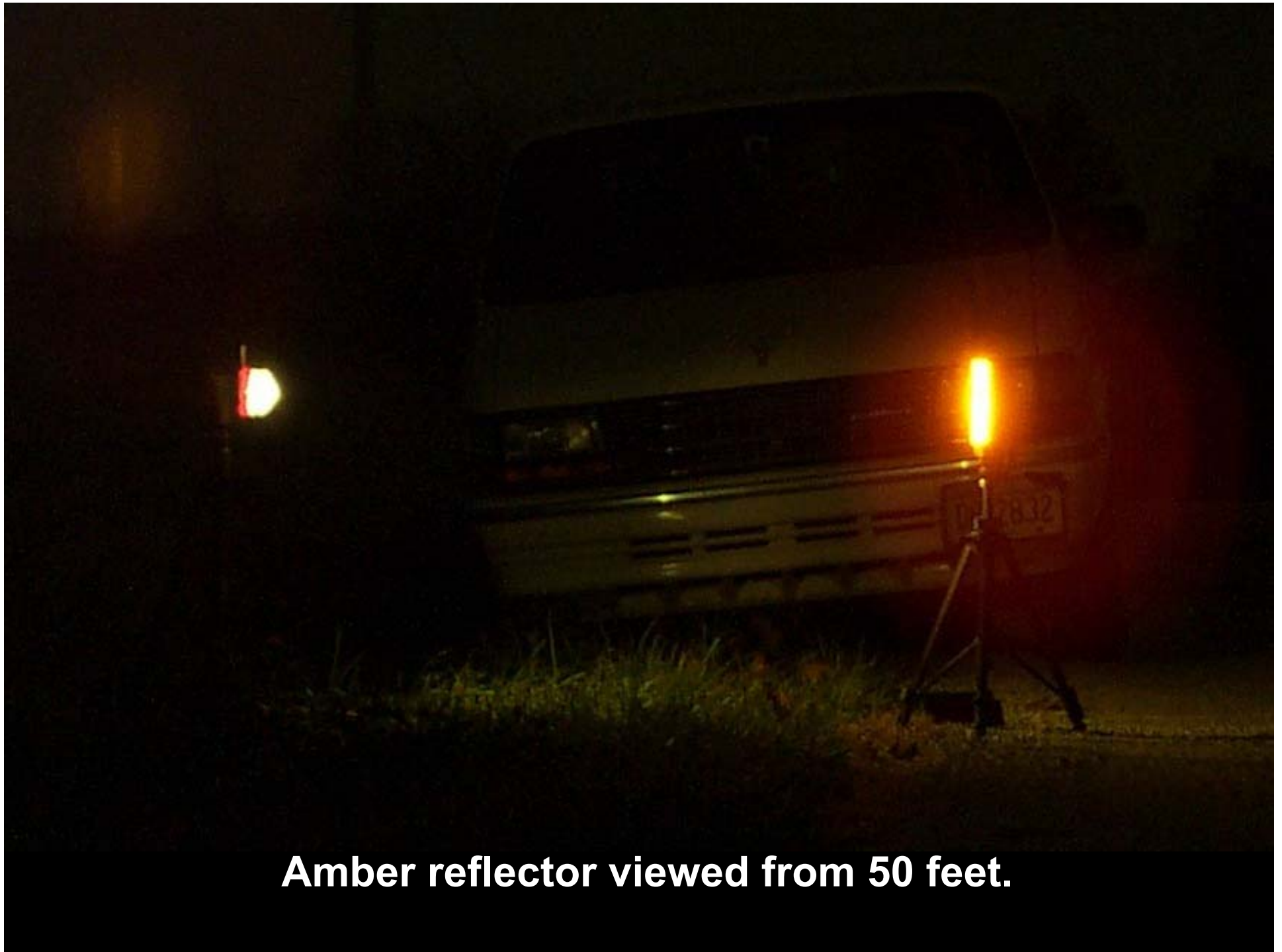
Amber reflector viewed from 50 feet.