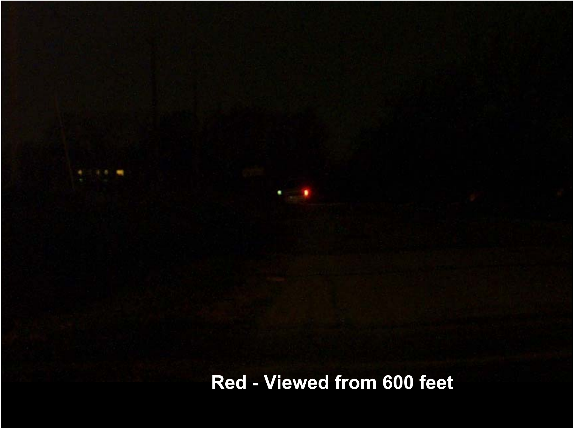
Red - Viewed from 600 feet