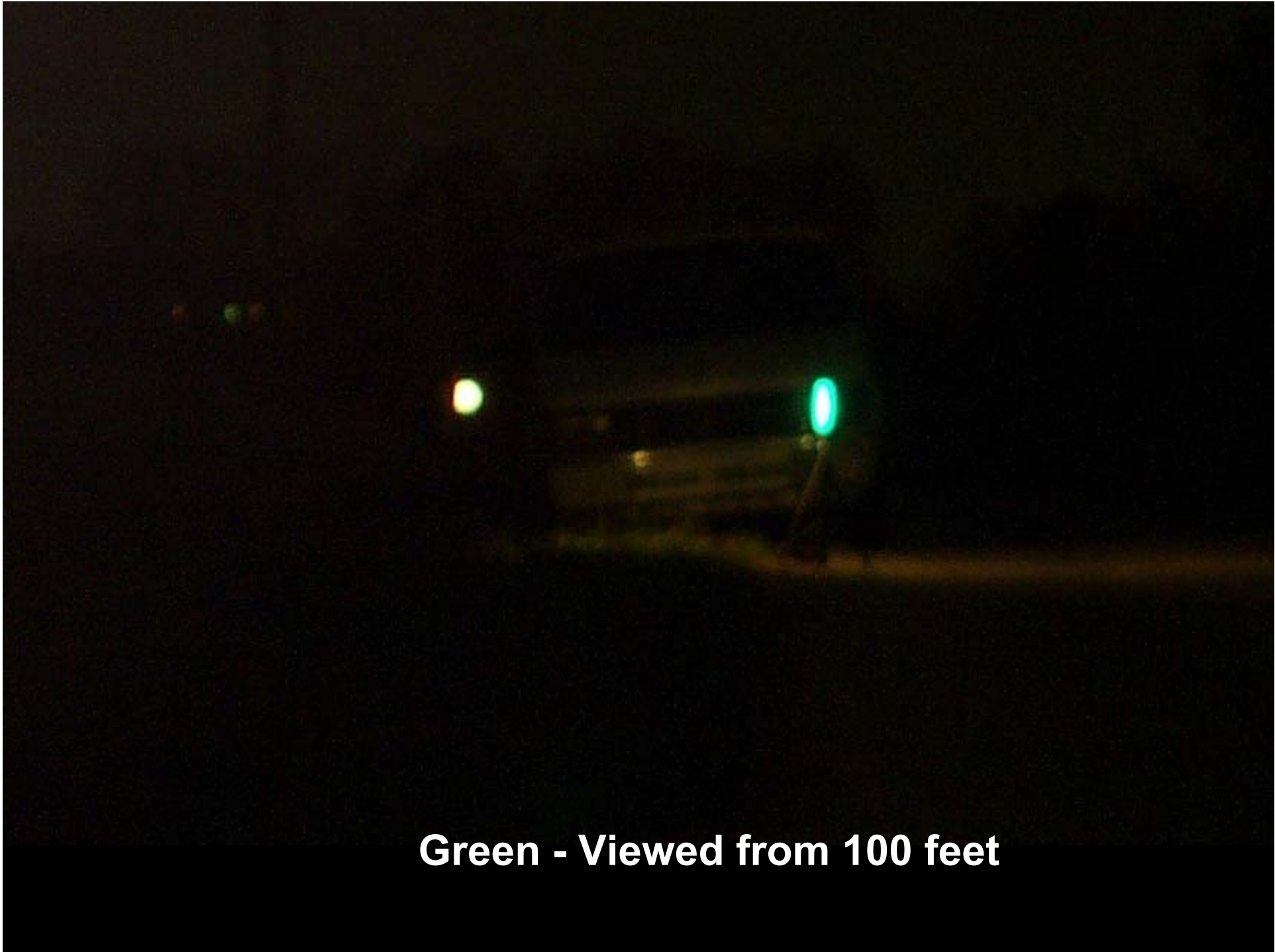
Green - Viewed from 100 feet