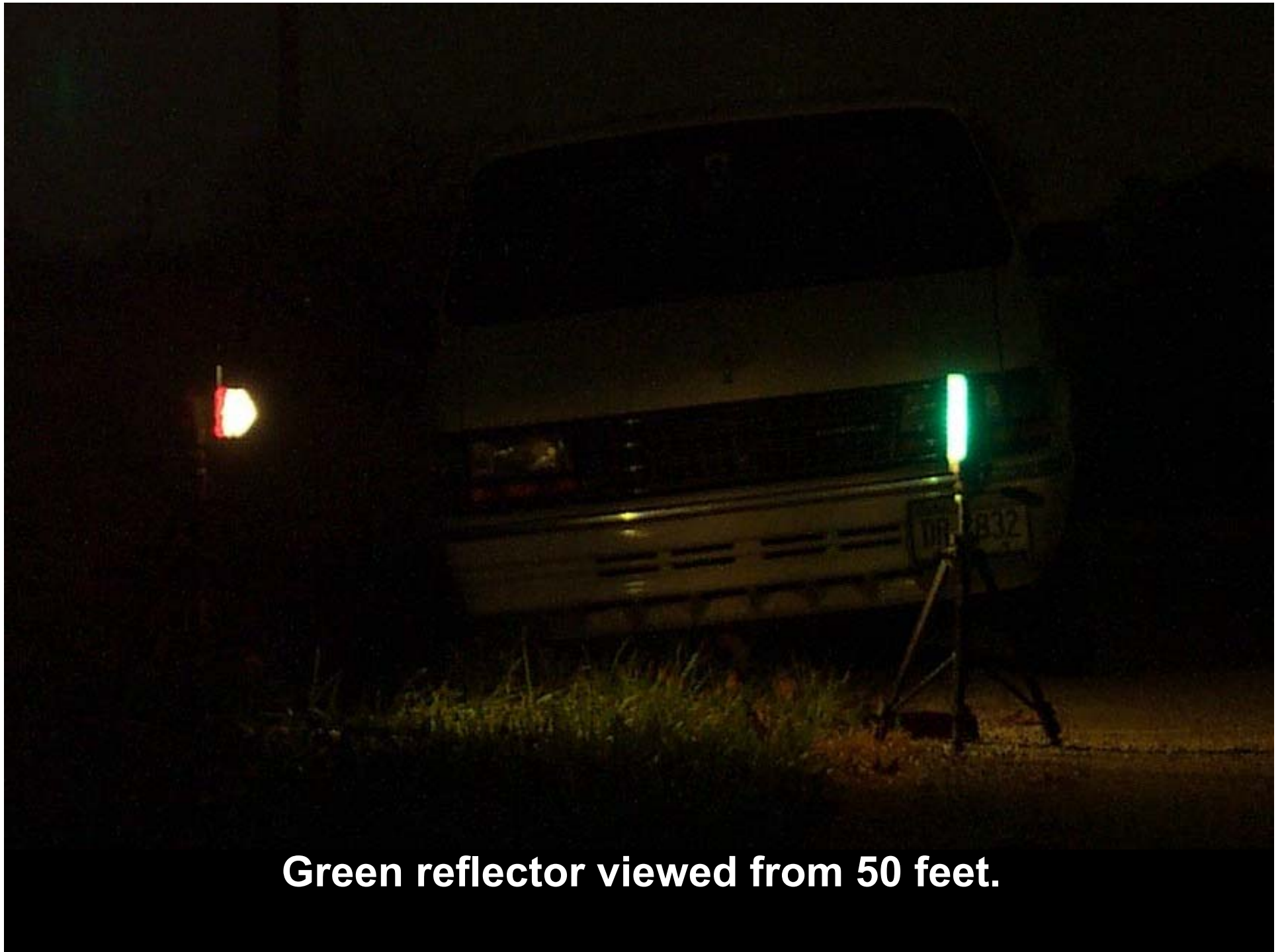
Green reflector viewed from 50 feet.